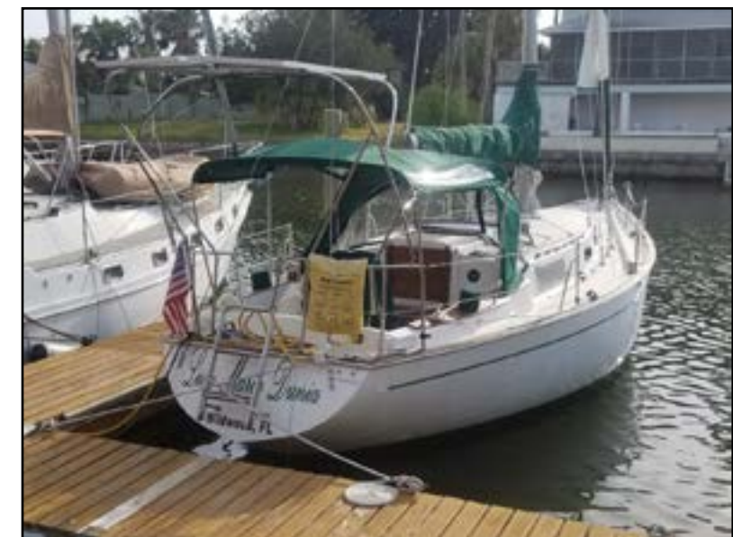
The sloop Lucy Maria Dunia

the next evening to anchor overnight, we picked up a friend who lives in Crystal River for the sail back to HBYC.