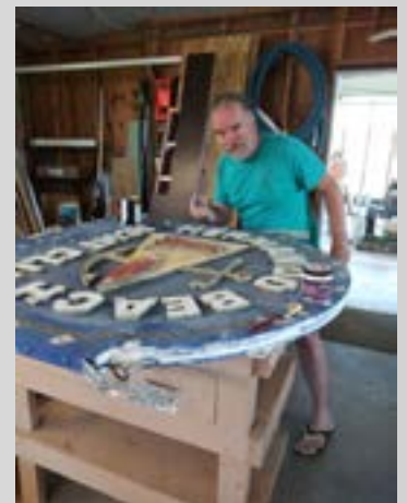
A touch there...