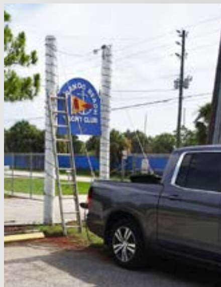
Hoisting the sign by pickup truck