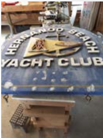
Bottom of the old sign