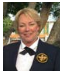
Commodore Patti Ames