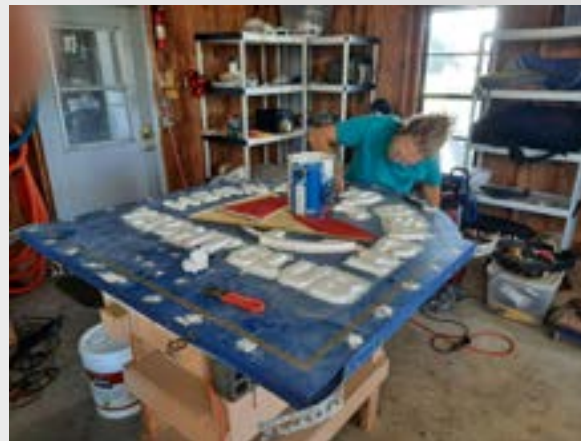
A touch here...