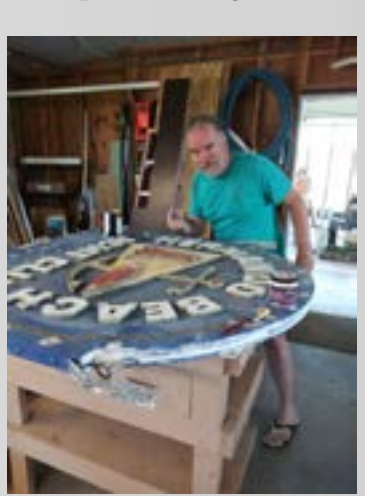
A touch there...