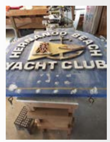
Bottom of the old sign