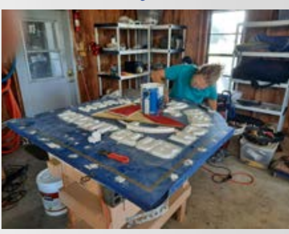
A touch here...