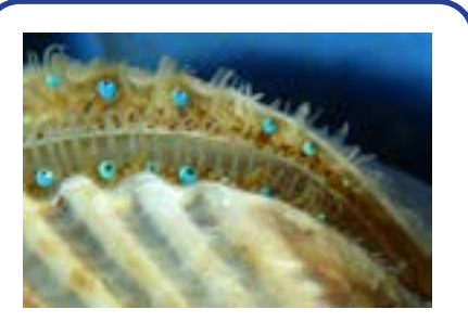
The scallop's row of blue eyes can mesmerize even long-time scallopers. They say many old-timers have returned empty-handed, hesitating at the moment of truth.

It is legal to land up to two gallons of whole bay scallops in the shell, or one pint of scallop meat each day during the open season. Recreational scallopers may not possess more than 10 gallons of