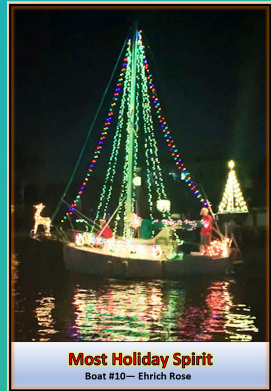
Most Holiday Spirit Boat #10— Ehrich Rose