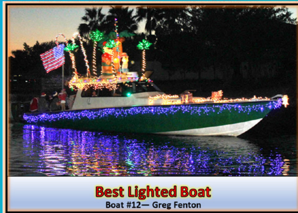
Best Lighted Boat Boat #12— Greg Fenton