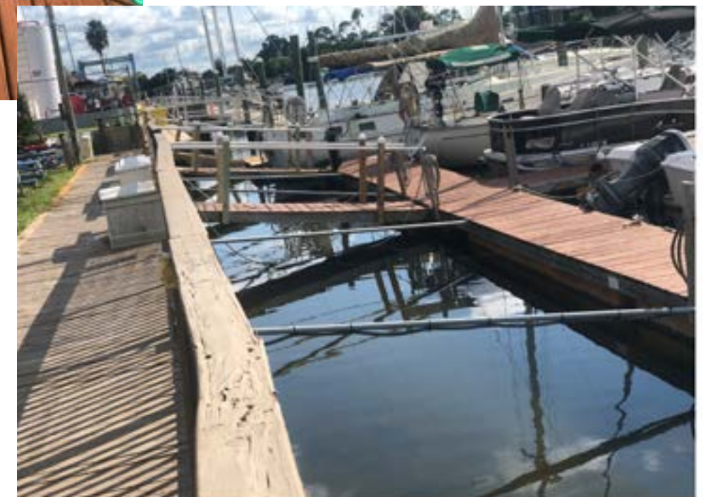
Notice the white PVC pipe used on HBYC's new handrails (above and upper left). The PVC pipe was added to prevent deterioration and improve the look of the railings.

Social distancing and/or masks will be required