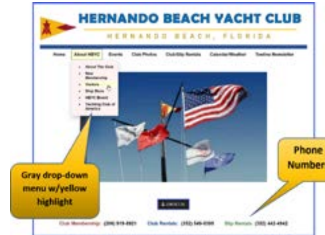
Gray drop-down menu w/yellow highlight