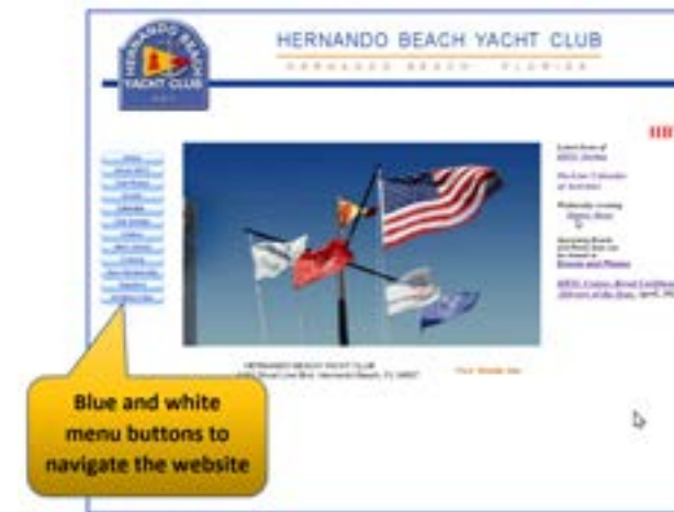
Blue and white menu buttons to navigate the website